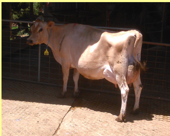
Nadia 2nd—Over 7 2nd in udder