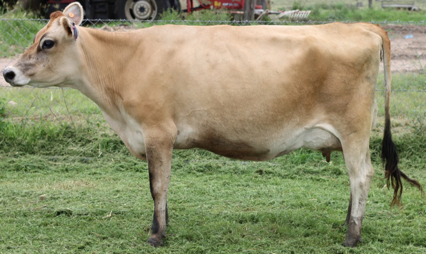
Walkah Rewards Magnificent 2nd 3-4 in milk on farm challenge Sire: Rapid Bay Reward Dam: Walkah Guapo's Magnificent