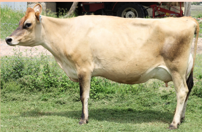
Shirlinn Reagan StarFinch ET 2nd 4-5 in milk on farm challenge Sire: Rapid Bay Reagan Dam: Shirlinn Caesar StarFinch EXC 92