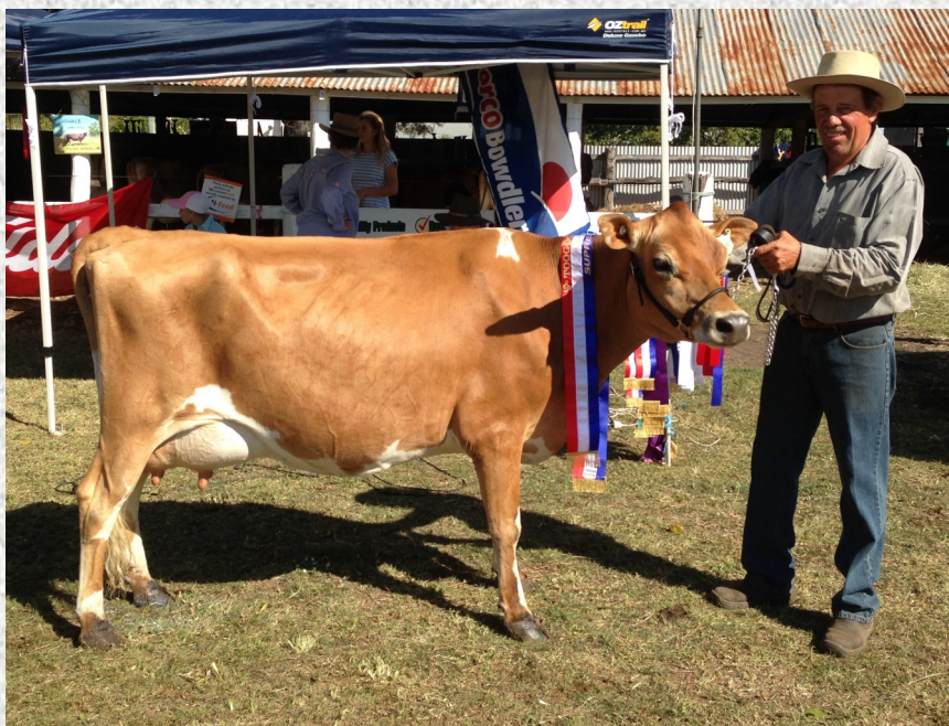
Jovale Goldmine's Wafer Sire: Caboondah Goldmine Dam: Jovale Sam's Wafer Supreme Cow at Toogoolawah Show 2014