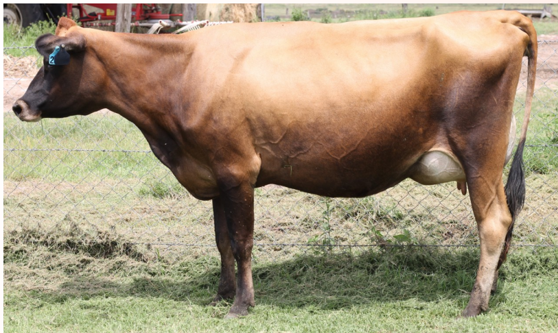
Walkah Reagan Priscilla 1st under 2½ in milk Reserve Champion heifer on farm challenge Sire: Rapid Bay Reagan Dam: Walkah Grand Prix Priscilla