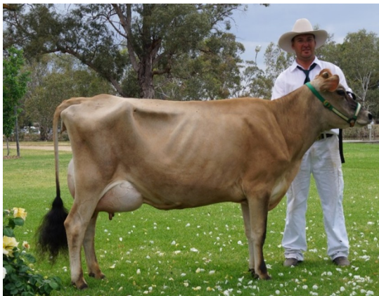
CHAMPION INTERMEDIATE HEIFER & JNR BEST VESSEL: MARAGLEN REGIONS DAWN 2 ND . SIRE: MAACKDAIRY REGION

With our team of 15 at Numurkah Show we had great success starting with Reserve Champion Bull, Reserve Junior Champion Heifer, Champion Intermediate Heifer and Best Vessel under 4 years. We also had 5x 2 nd placings and 7x 3 rd placings!