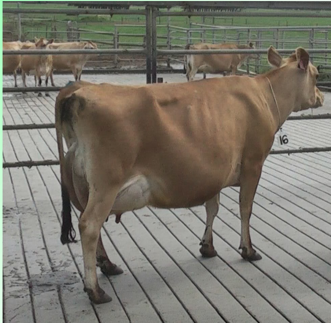
Ardlay Choice Lynette 2 Sire: Nirravale First Choice