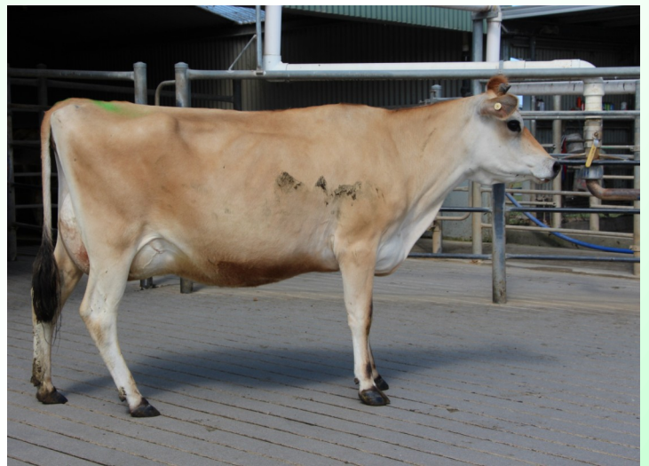
Ardlay Grandious Confetti Sire: Rapid Bay Grandious