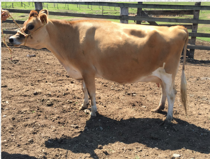
Joevale Connection Pandora