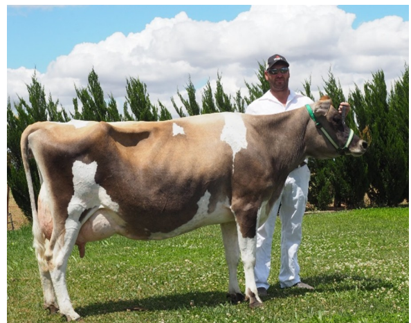
1 ST PLACE DRY COW: SALVATION COMERICA MELYS EX90 SIRE: BRIDON REMAKE COMERICA