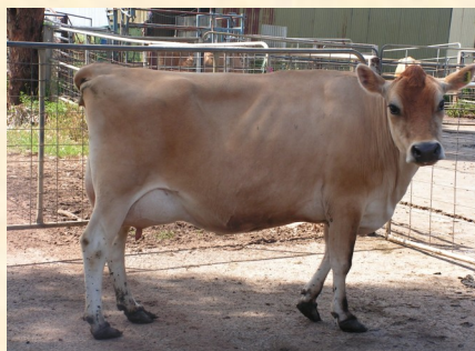
SH Shirley 34 VHC 92