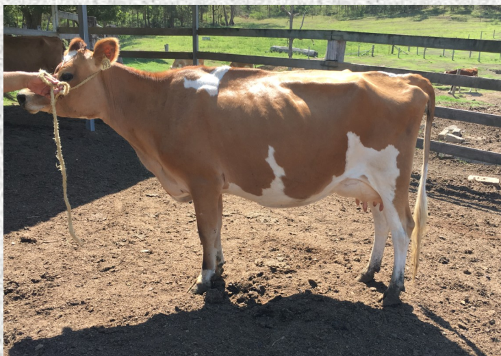
Joevale Connection Waffer