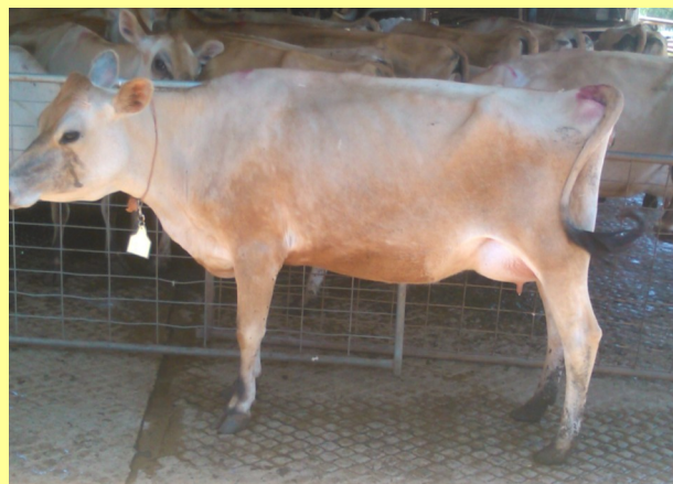
Abis Polly 2 Junior Honourable Mention 2nd—2½ to 3