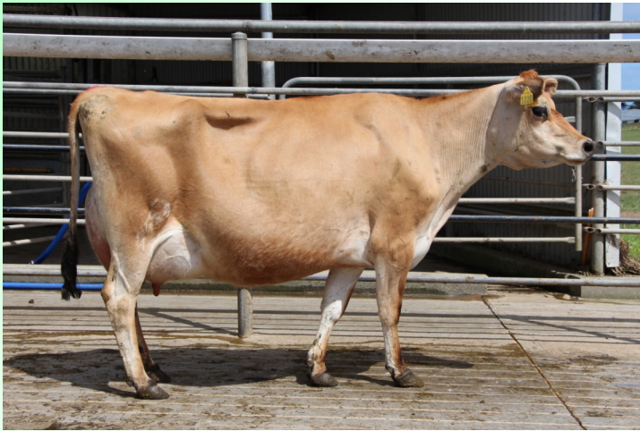
Ardlay Red Lynette Sire: Ardlay Hasty Red