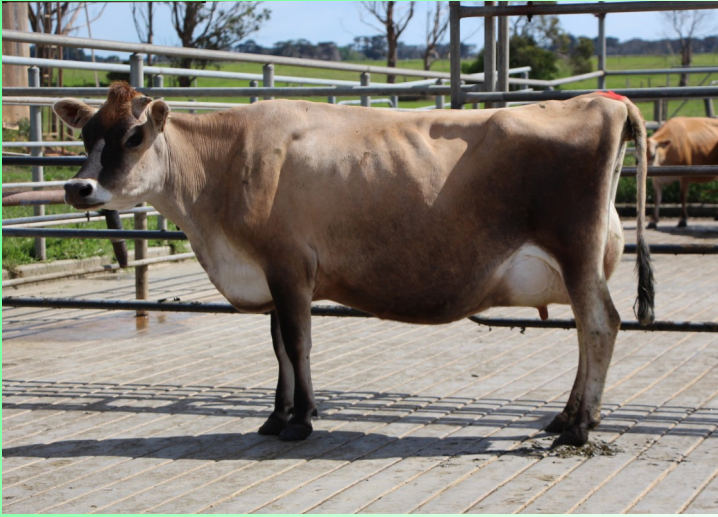
Ardlay Dundee Satin Sire: Ardlay Bosses Dundee