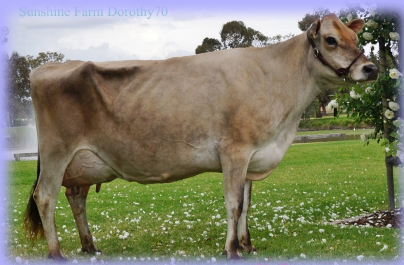
Sunshine Farm Dorothy 70