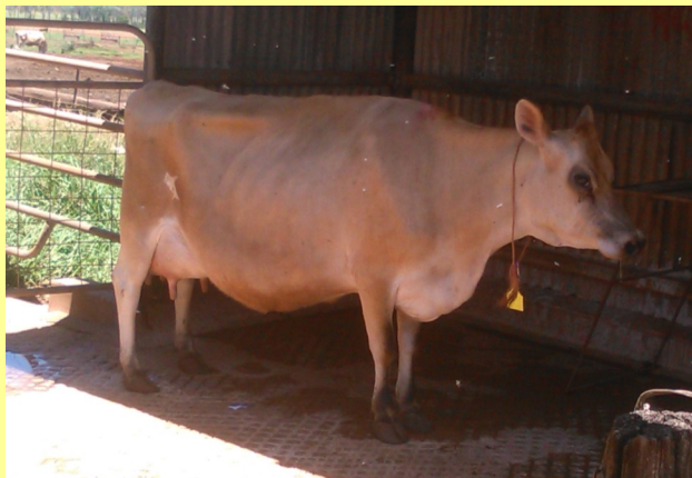
Abis Christeen Reserve Champion Cow Won Cow over 7 3rd in Udder