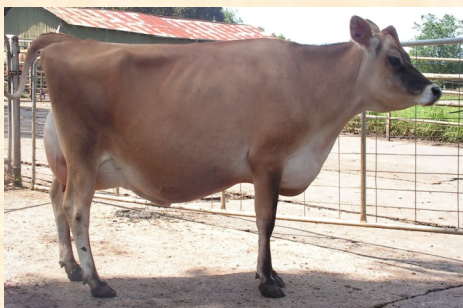
SH Fuchsia 32 VHC 93