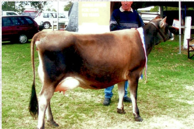
Joevale Pandora 17th Sire: Mountain Dale Supper Sam Dam: Joevale Pandora 11th