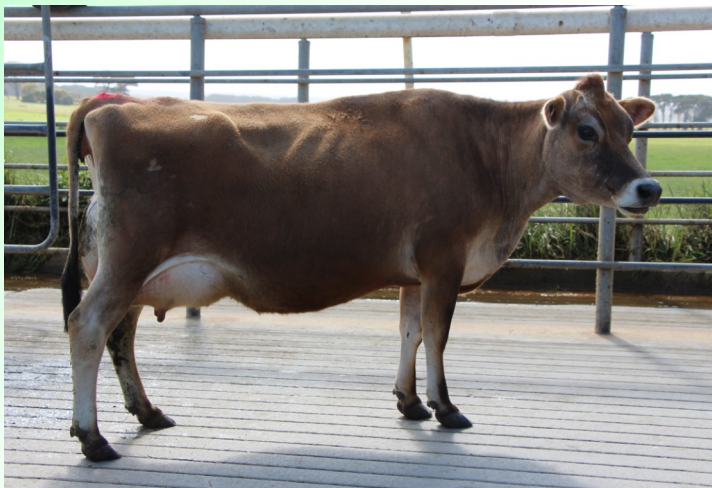
Ardlay Troubadors Satin Sire: Ardlay Troubador She is a sister to Ardlay Lynmarks Satin and she is the aunty to cow Ardlay Dundee Satin.