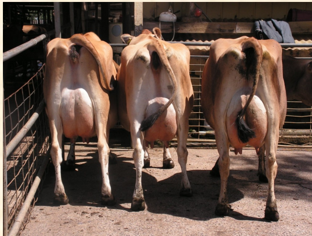
2015 on Farm Challenge – Pen of 3

Our Fuchsia family was well represented in this years On Farm Challenge with Fuchsia 32 winning the 4YO class and Fuchsia 30 2 nd in the 5YO class. Our Fuchsia family was founded by Dalith Folly's Fuchsia HC+ who was sired by Warwick Folly's Peacemaker. Dalith Folly's Fuchsia was the dam of SH Fuchsia VHC (90) EX, SH Fuchsia 2 SUP (92) EX and SH Fuchsia 4 VHC (90). Fuchsia 30 descends from the Fuchsia 2 line (5 generations removed), whereas Fuchsia 32 descends from the Fuchsia 4 line (grand daughter) via Fuchsia 22 VHC (91) EX.