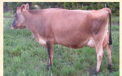
SH Fuchsia 30 VHC 90