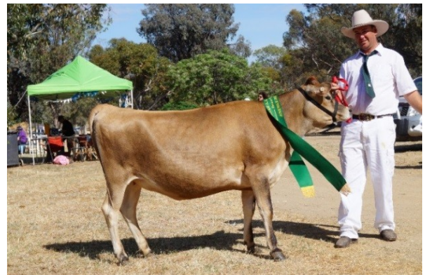
RESERVE JRN CHAMPION HEIFER: MARAGLEN PAL'S MISTY ISLE SIRE: LILAC GROVE RINGS PAL