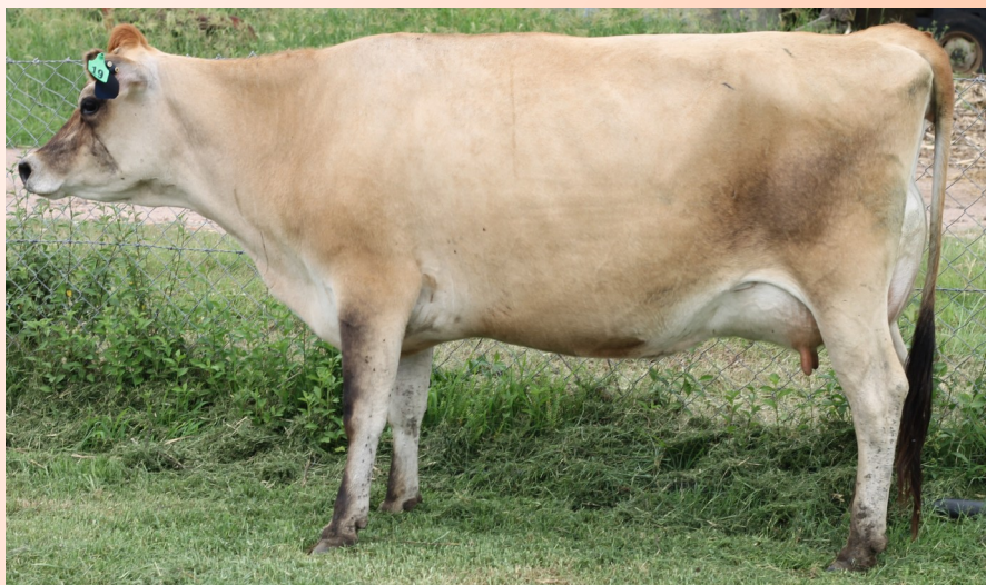
Walkah Reward's Violet Sire: Rabid Bay Reward Dam: Cedarvale HJ Violet