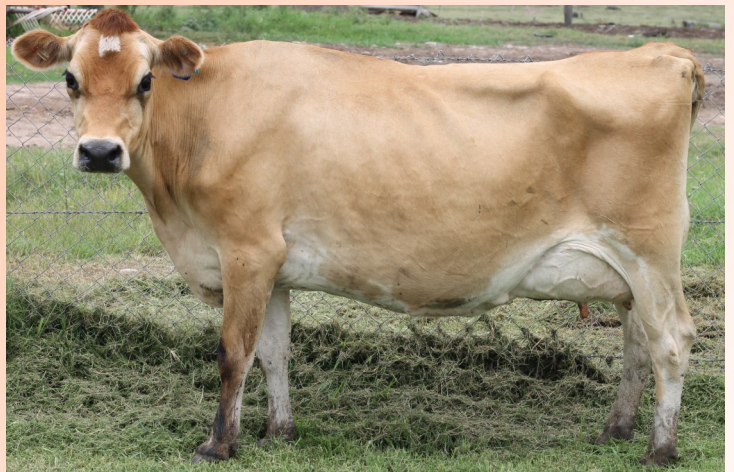
Walkah Musketer's Sunbeam 3rd 4-5 in milk on farm challenge Sire: Walkah Musketer Dam: Walkah Lethal's Sunbeam