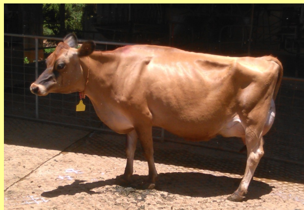
Charlies Mandy Senior Honourable Mention Won 5-7 4th in udder