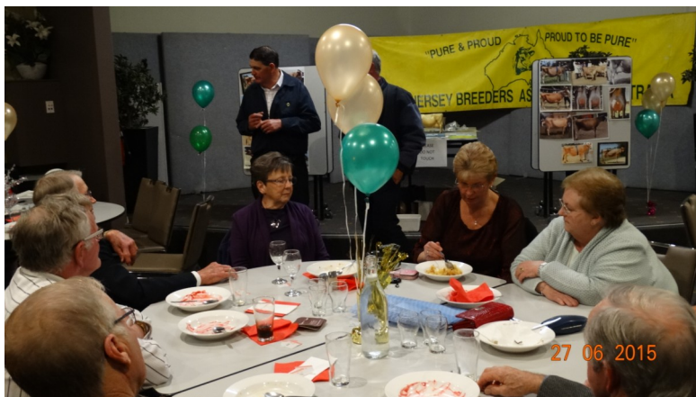
25th Annaversary Dinner At Kyabram Club