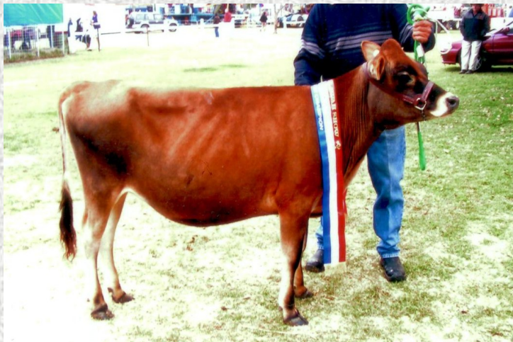
Joevale Nanett Sire: Mountain Dale Supper Sam Dam: Joevale Dalistic Rose 2nd