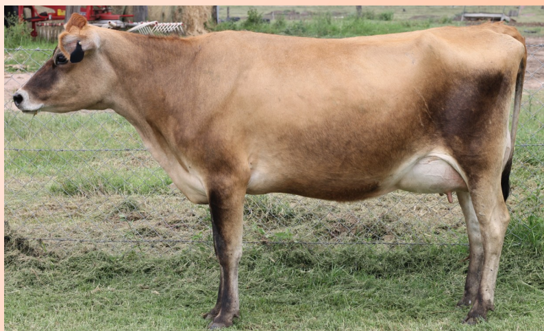
Walkah Governor's Mollee Sire: Griffins Governor ET Dam: Walkah RBR Mollee