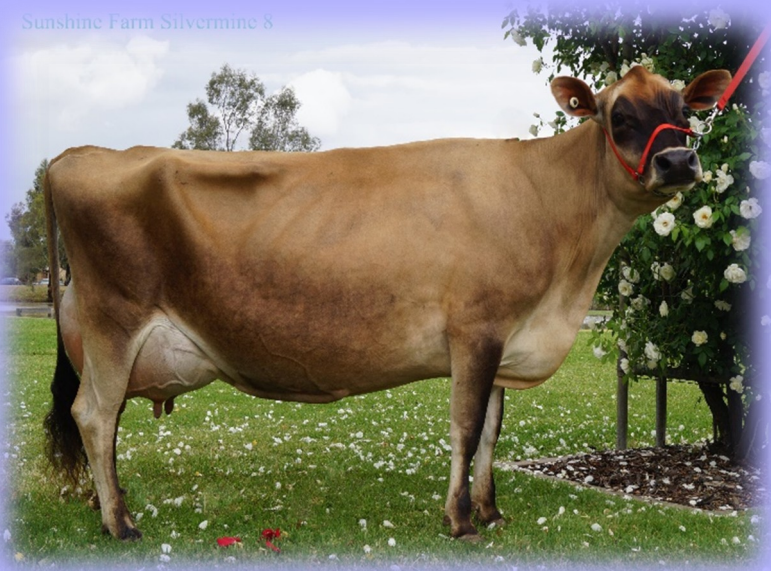
Sunshine Farm Silvermine 8