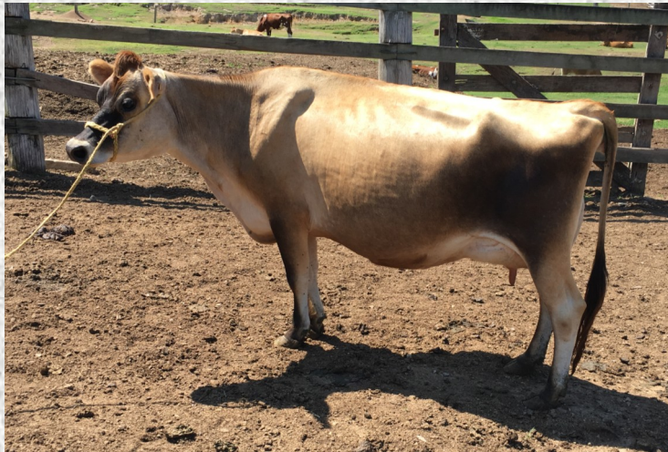
Joevale Sams Peace 2nd