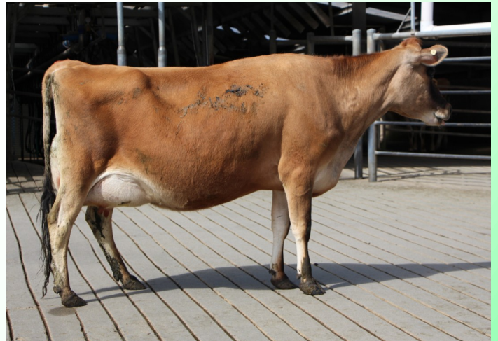
Ardlay Laddys Lynette 4 Sire: Sunshine Farm Laddy