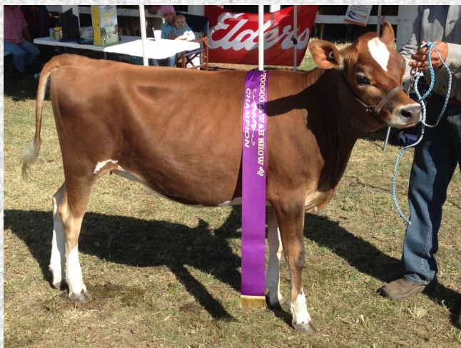
Jovale Magnificent Nanett Sire: Deloram Magnificent Connection Dam: Jovale Nanett