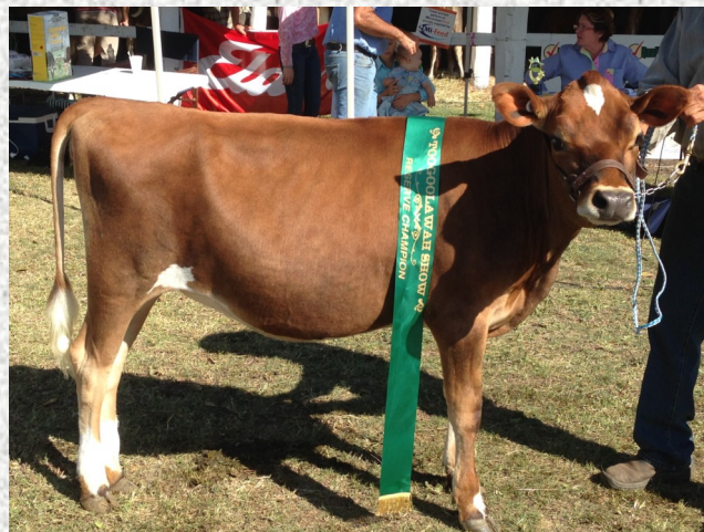
Joveale Magnificent Pandora Sire: Deloram Magnificent Connection Dam: Jovale Goldmine's Pandora