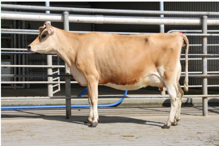
Ardlay Grandious Lynette Sire: Rapid Bay Grandious

The other two photos are Ardlay Dundee Satin (Sire: Ardlay Bosses Dundee) and Ardlay Troubadors Satin (Sire: Ardlay HR Troubador) and she is Lynmark Satin's sister, so she is an aunty to Ardlay Dundee Satin.