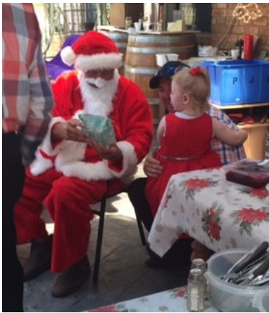
GVPJBCC Christmas Party