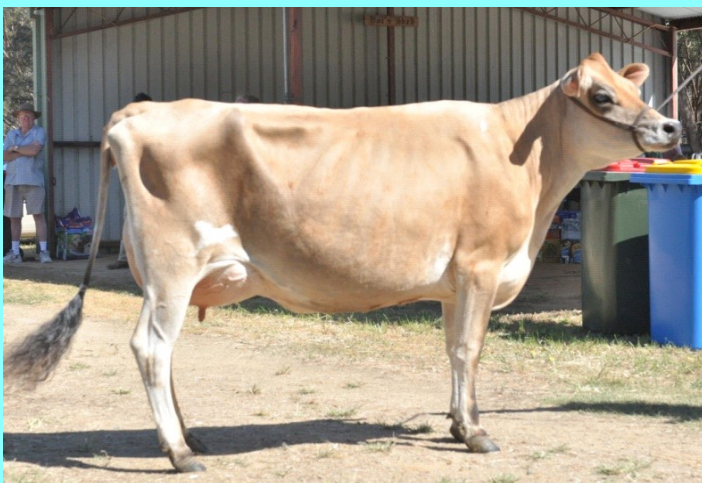
Sunshine Farm Cherry 94 1 st under 2 ½ years in milk At Kyabram & Numurkah Reserve Junior Champion Kyabram