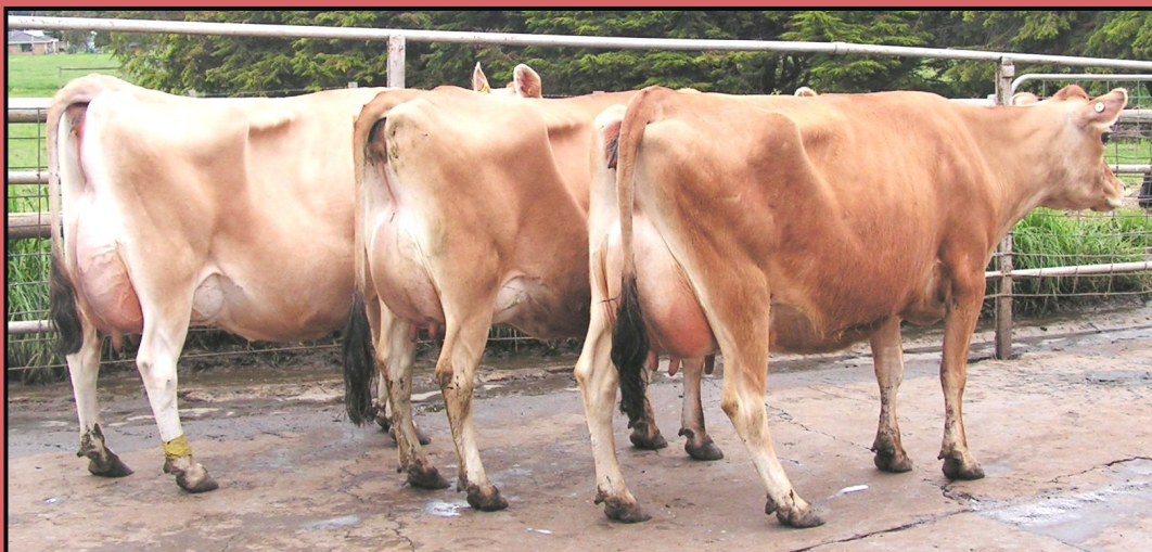
2011 on Farm Challenge—Pen of 3