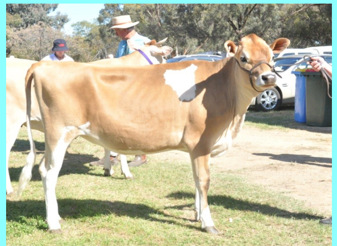
Sunshine Farm Lovely 202 1 st yearling Heifer Jersey and all breeds Juvenile Champion

WE WOULD LIKE TO WISH ALL JERSEY ENTHUSIASTS THE VERY BEST FOR CHRISTMAS AND HOPE THE NEW YEAR IS SAFE AND HEALTHY FOR ONE AND ALL