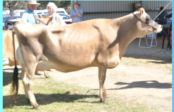
Sunshine Farm Lucielle 62 Junior Champion Best udder 3 years and under 1 st 3 years in milk