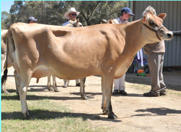
Sunshine Farm Dorothy 69 Reserve Champion cow 2 nd Best Udder 2 nd 4 years in milk