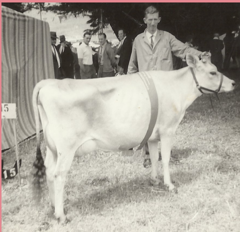
N.V. Annette 18 V.H.C.

Our very 1st Champ Cow was NorleenVale Annette 18th Champion at Camperdown. Our last was Navillus Sunflower 42 at P.J.B fair at Numurkah 2001.