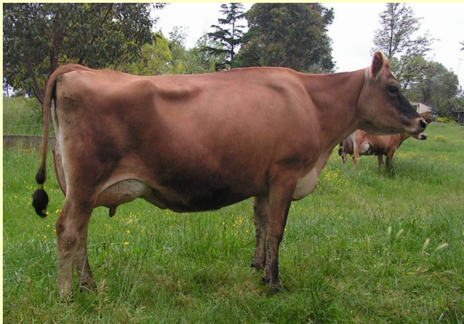
SEVEN HILLS SLEEPING BEAUTY 10 VHC 90 SIRE: RAPID BAY RESSURECTION

We were able to purchase the granddaughter of Sleeping Beauty 162 at the second stage dispersal; Lynbrae Sleeping Beauty 259 VHC, a Lynbrae Valley Beacon daughter out of Lynbrae Sleeping Beauty 221 Sup. Sleeping Beauty 259 VHC had 3 daughters, two of which gained a VHC classification, however only the first of these has progeny in the herd today. This family is currently represented by seven members of which the 2 oldest are SH Sleeping Beauty 10 VHC 90 and SH Sleeping Beauty 11 VHC 92.