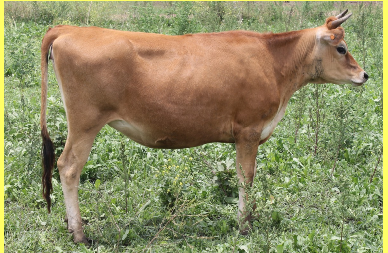
Walkah BRC Fingers Sire: Bredon Remake Comerica Dam: Cedar Vale Jade Fingers Juvenile Champion On Farm Challenge 2013 First 9-15 months On Farm Challenge 2013