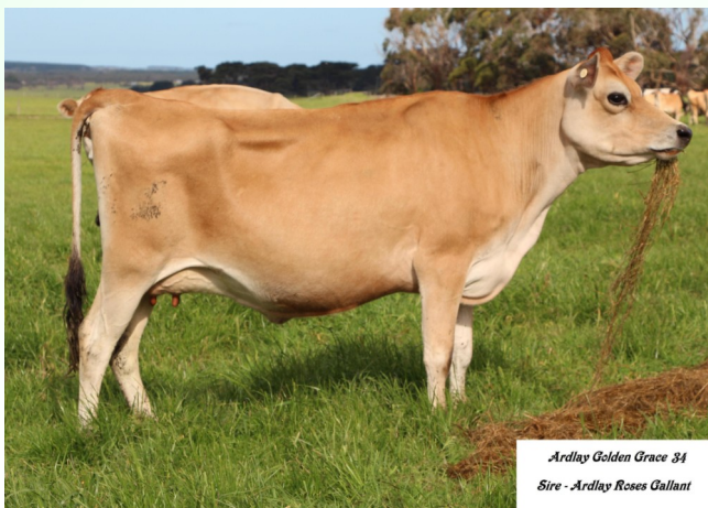
Ardlay Golden Grace 34 Sire: Ardlay Roses Gallant

Dundee Satin and Sweetrose 74 are both daughters of Ardlay Bosses Dundee (Linmore Zebs Boss from Ardlay Designs Lorna a grand daughter of Ferdon Choice Harvest).