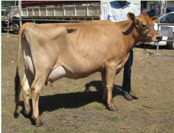
Glenvillan Lois Sire: Glenvillan Astronomical Dam: Glenvillan Popular Lily