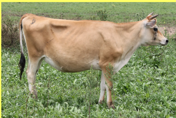
Walkah Garcia Lois Sire: Rapid Bay Garcia Dam: Aeroview Lois