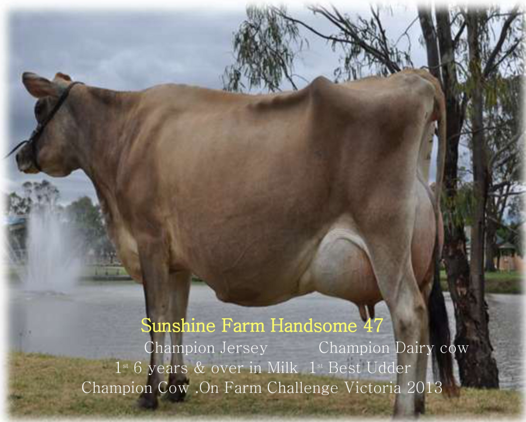
Sunshine Farm Handsome 47

Champion Jersey Champion Dairy cow 1 st 6 years & over in Milk 1 st Best Udder Champion Cow .On Farm Challenge Victoria 2013