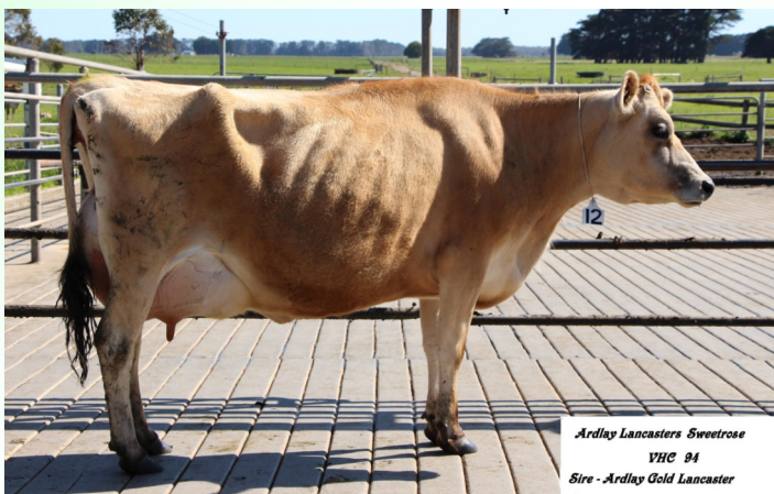
Ardlay Lancasters Sweetrose VHC 94 Sire: Ardlay Gold Lancaster