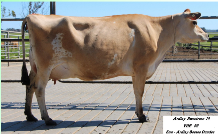
Ardlay Sweetrose 74 VHC 92 Sire: Ardlay Bosses Dundee