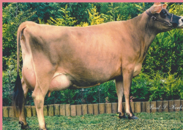
N. Love Lies 21 V.H.C. Champ Jersey Cow Melb Royal

Along with her daughter stood 1st & 2nd in Best Vessel & won Dam & Daughter 1991