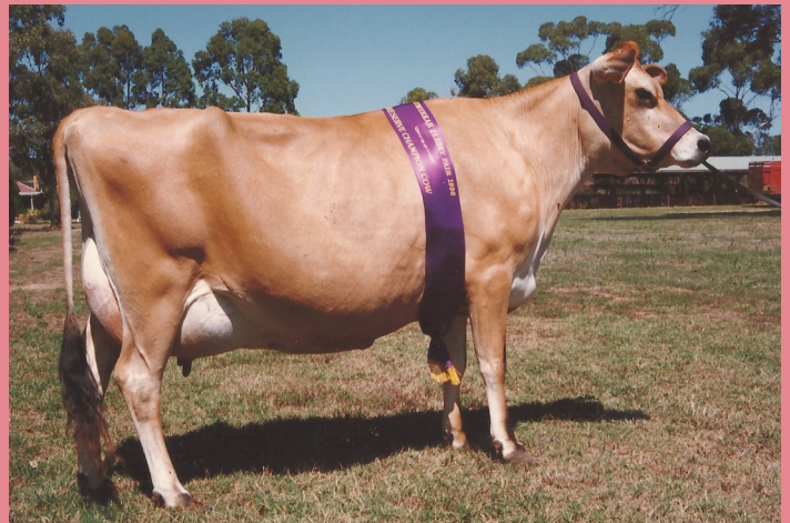
N. Sunflower 24 V.H.C.

Our Melb Show team always consisted of 13. We tried to encourage the younger breeders over the years and helped them to establish their studs by donating them an animal. We always volunteered and offered our farm for classification, judging and field days to promote Jerseys and helped in any other capacity where needed.