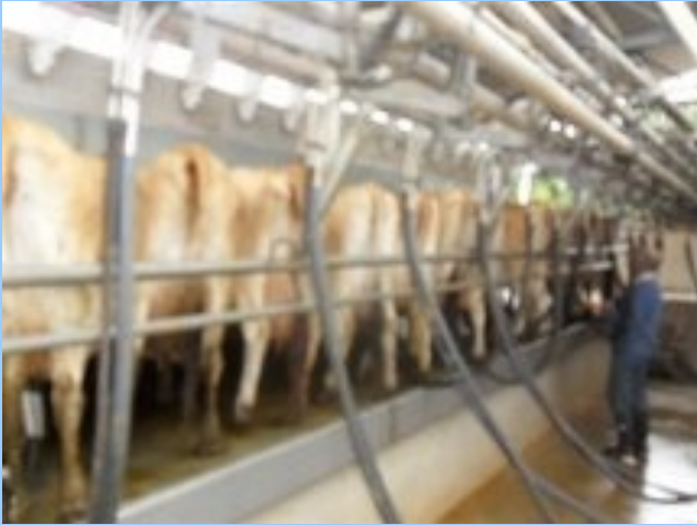
New Dairy gone from 6 aside to 16 swing over.