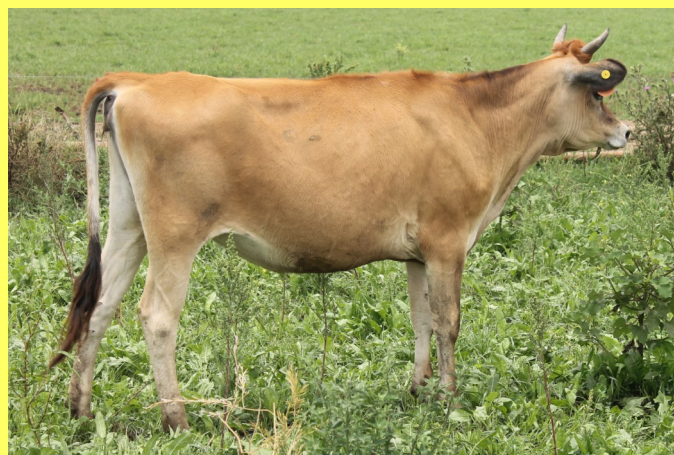
Walkah Hasty Lindy Sire: Walkah Belle's Hasty Dam: Walkah Guapo's Lindy