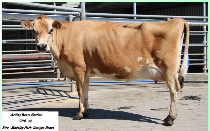
Ardlay Bravo Confetti VHC 92 Sire: Madeley Park Designs Bravo