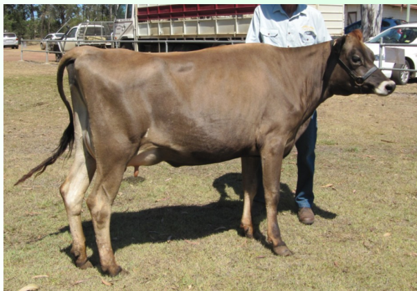
Glenvillan Princess Kate Sire: Beledene Duke's Lord Dam: Glenvillan Princess Love