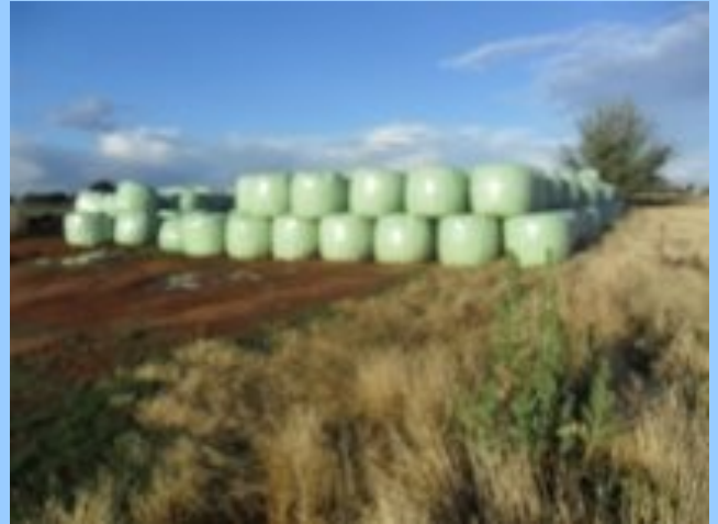
Feed in Storage