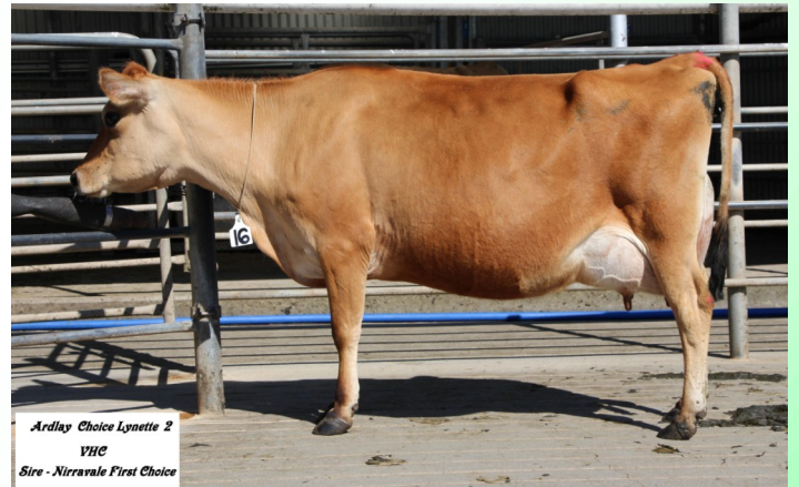
Ardlay Choice Lynette 2 VHC Sire: Nirravale First Choice