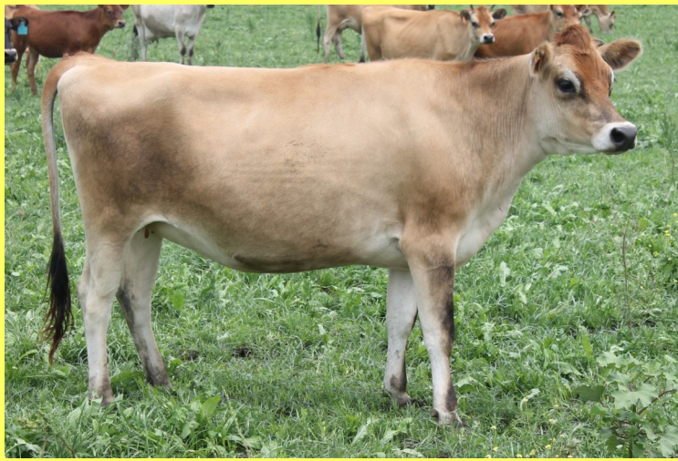
Walkah Reward's Violet Sire: Rapid Bay Reward Dam: Cedar Vale HJ Violet