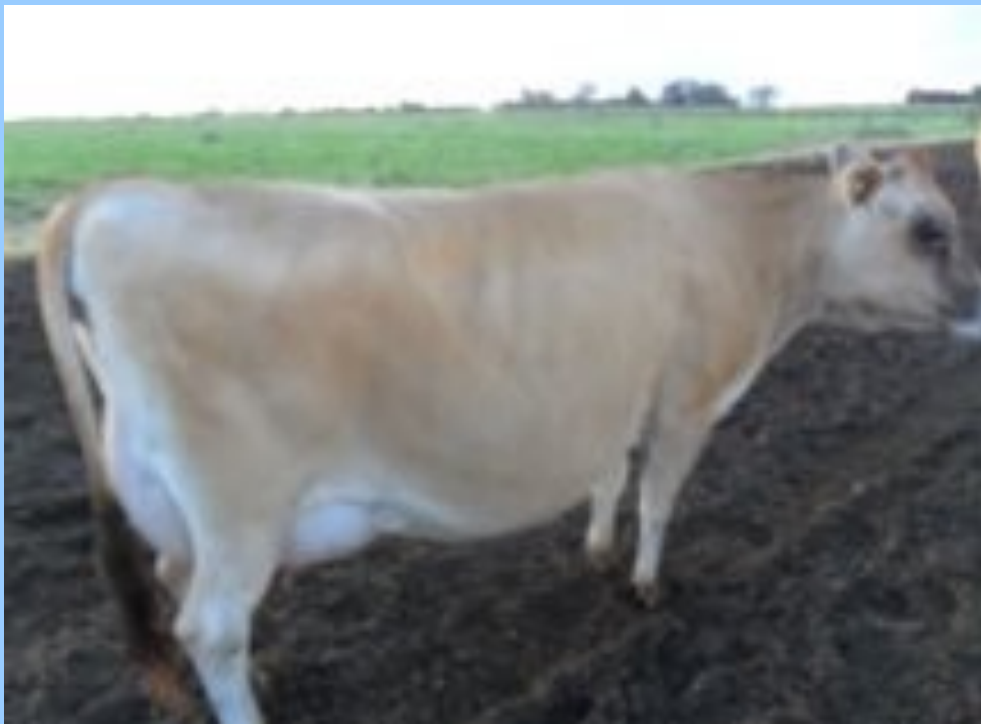
Erindale Fantatic Silvermine VCH Champion Cow Numurkah Feature Show 2011 Just calved Sidermines won the top producing family