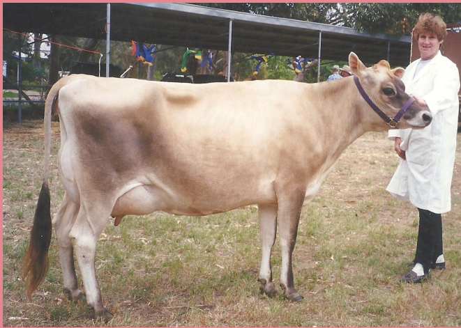
N. Pam 43 V.H.C