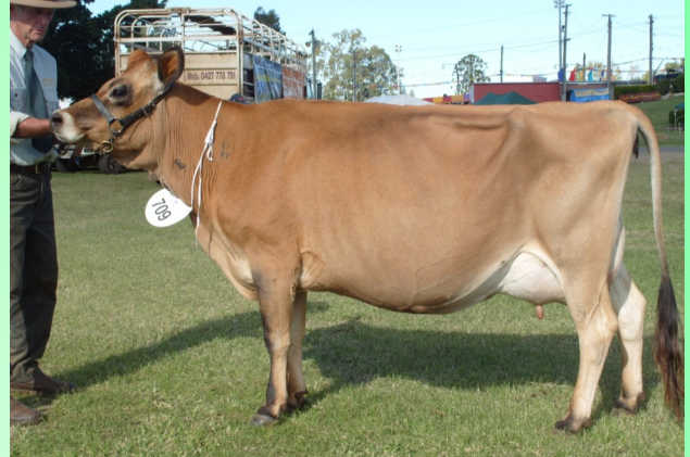
Glenvillan Model Sire: Glenvillan Astronomical Dam: Glenvillan Moonlight