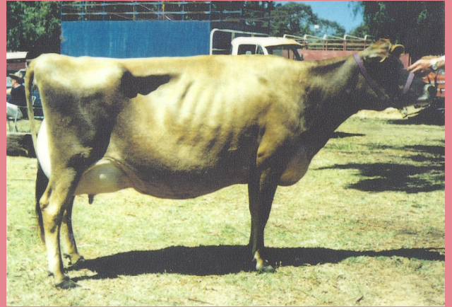
N. Beryl 20 V.H.C. Champ Cow Kyabram & Cobram