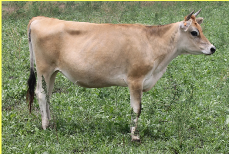
Walkah Reward's Magnificent Sire: Rapid Bay Reward Dam: Walkah Guapo's Magnificent