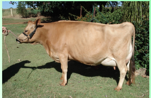
Glenvillan Pretty Lee Sire: Glenvillan Astronomical Dam: Glenvillan Pretty Lassie

4 of these cows by our great breeding sire Glenvillan Astronomical.