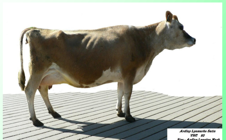
Ardlay Lynmarks Satin VHC 92 Sire: Ardlay Lynettes Mark