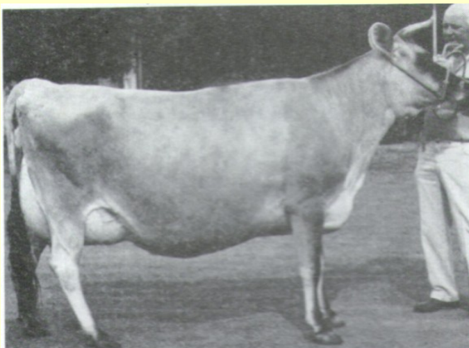
Lynbrae Sleeping Beauty 162 VHC SIRE: Larmorna Designs Darnley Several first prizes at Gippsland fairs