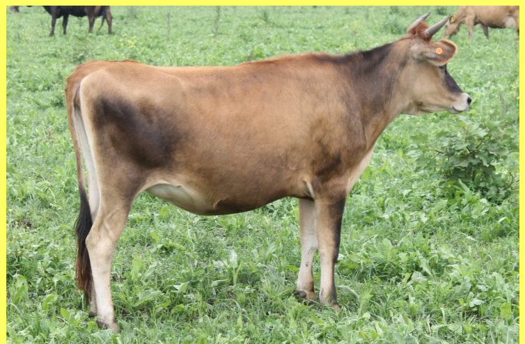
Walkah Grand Prix Royal Dell Sire: Rapid Bay Grand Prix Dam: Walkah Dazzler's Royal Dell Second 9-15 months On Farm Challenge 2013