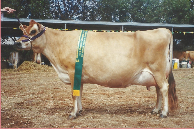
N. Rae 7 V.H.C. Champ Numurkah