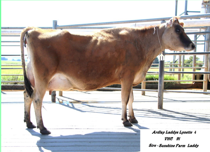
Ardlay Laddys Lynette 4 VHC 91 Sire: Sunshine Farm Laddy