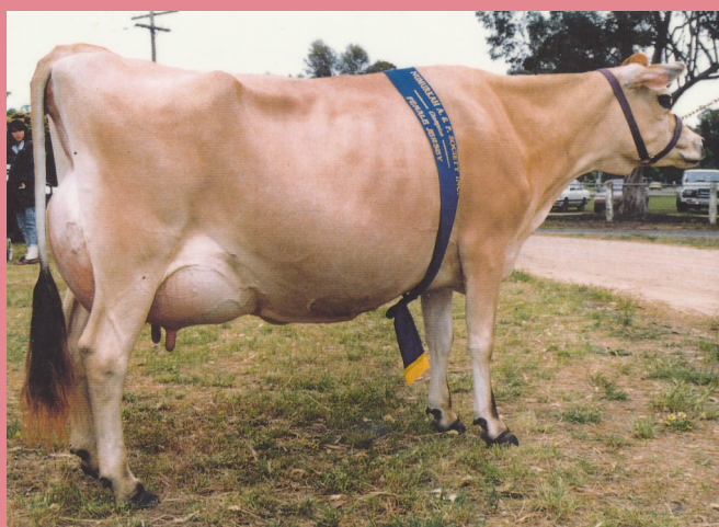
N. Regent Queen 3 V.H.C. Champ Cow Kyabram, Numurkah, Tatura

Along with her daughter stood 1st & 2nd in Best Vessel & won Dam & Daughter 1991