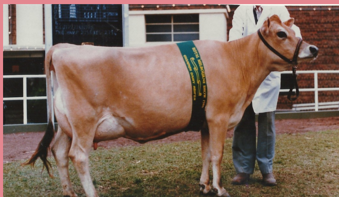
N. Rosebud 8 V.H.C. Champ Kyabram & Colac Bi Centenary Shows 1988 Jnr Champ Dairy Heifer Melb Royal