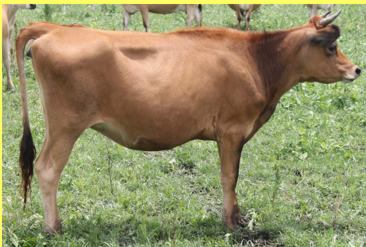
Walkah Grandious Royal Dell Sire: Rapid Bay Grandious Dam: Walkah Incomparable Royal Dell