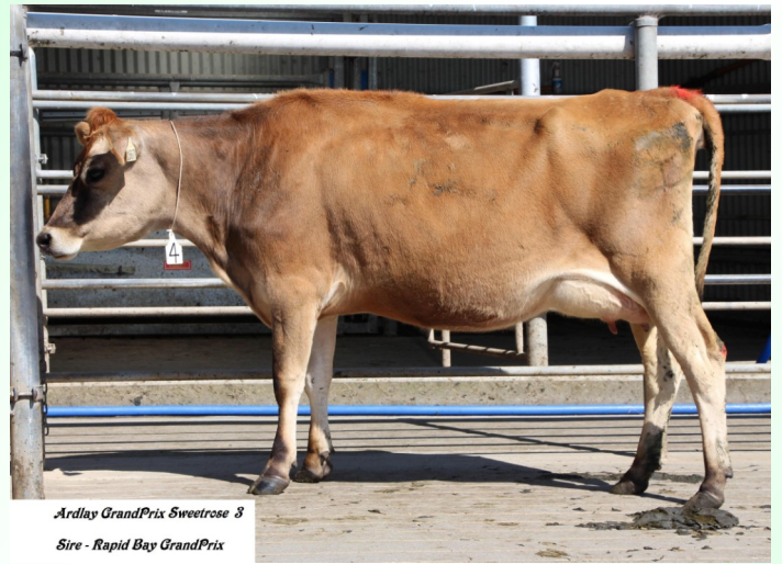
Ardlay GrandPrix Sweetrose 3 Sire: Rapid Bay GrandPrix