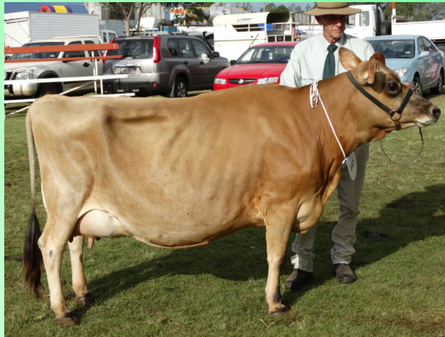
Glenvillan Maddy Sire: Glenvillan Astronomical Dam: Glenvillan Special Maid Champion Cow 2013 Qld Feature Show