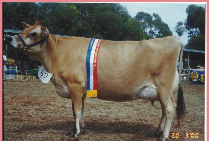
N. Sunflower 42 V.H.C.