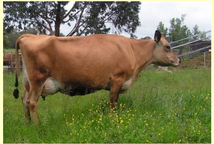
SEVEN HILLS SLEEPING BEAUTY 11 VHC 92 SIRE: SEVEN HILLS RED ISLE