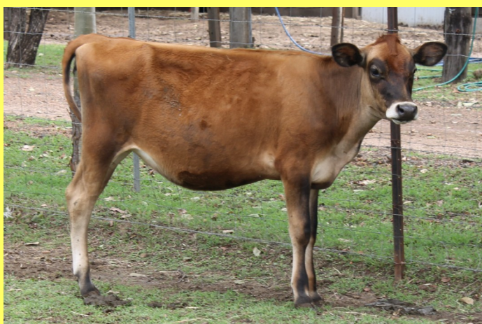
Walkah Regan Priscilla Sire: Rapid Bay Regan Dam: Walkah Grand Prix Priscilla