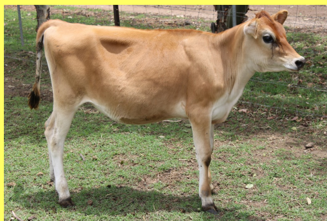
Walkah Nevada Magnificent Sire: Huroina Connection Nevada Dam: Walkah Guapo's Magnificent